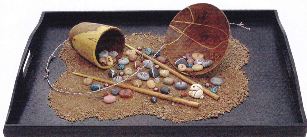
Fig. 3 Executive Order 9066: Gila River (Collaboration with Terry Yoshimura Bendt), 4.75" x 18" x 12"