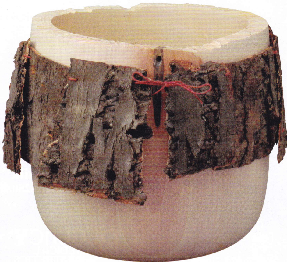
Fig. 4 Learning to Cope: Pear Incognito Under a Mantle of Cherry , 5.75" x 6" x 6"