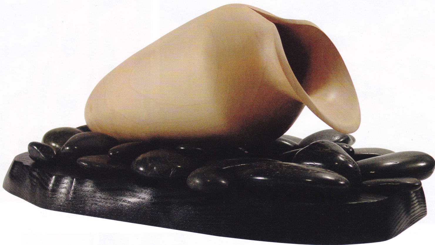
Fig. 1 In Her Dream , 4.25" x 11" x 6.75"